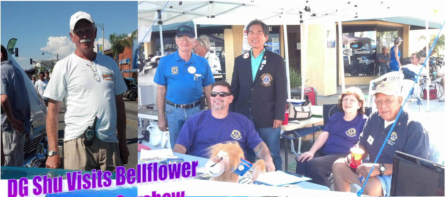
DG Shu Visits Bellflower Noon Lions Carshow