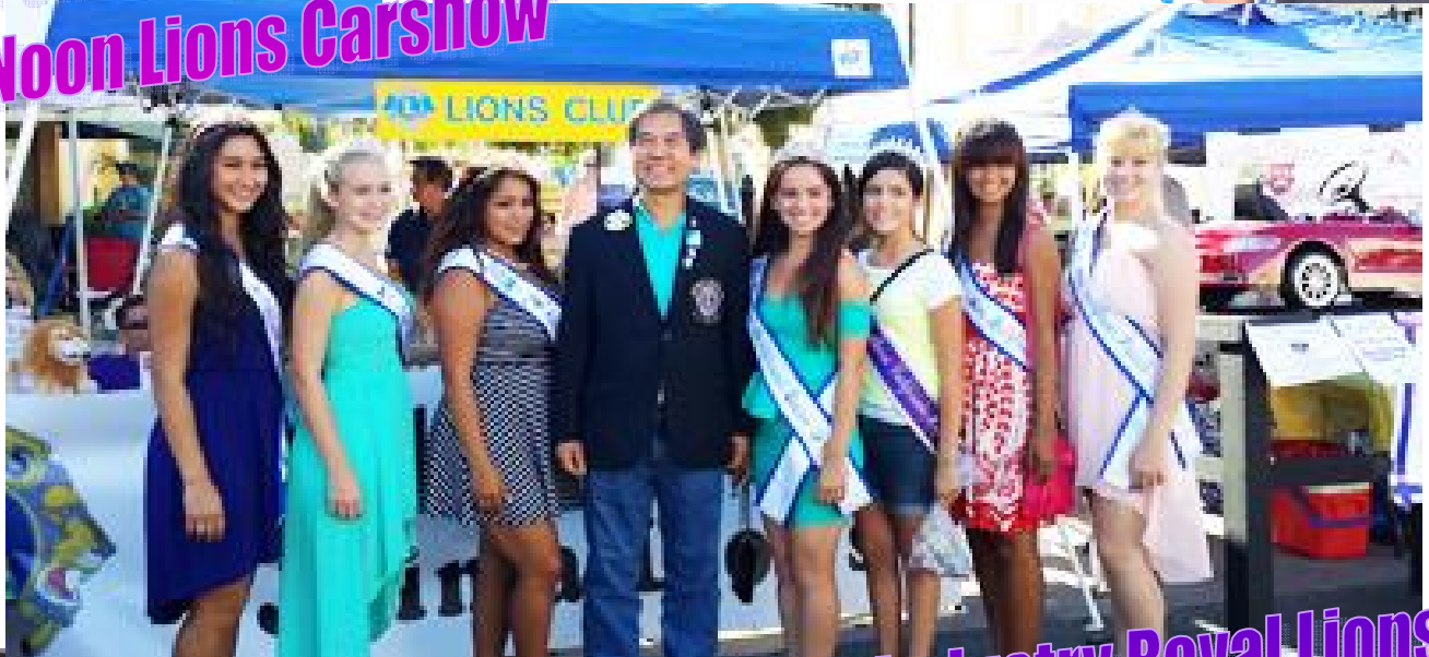
City of Industry Royal Lions with new members